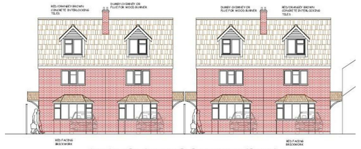
PROPOSED FRONT ELEVATIONS (EAST)